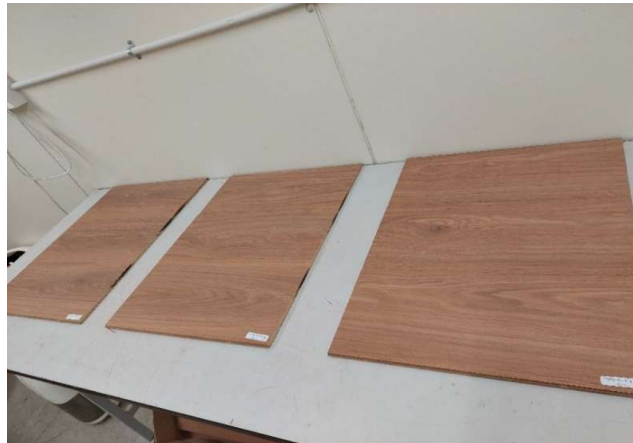
Figure 1: Flooring samples as supplied

Note: The samples were assembled at SGS office by the client.