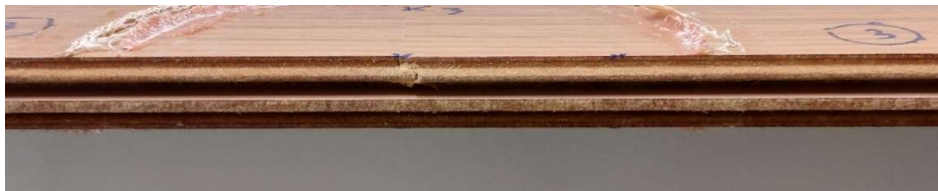
Figure 3 - Photo of sample 2 after disassembly